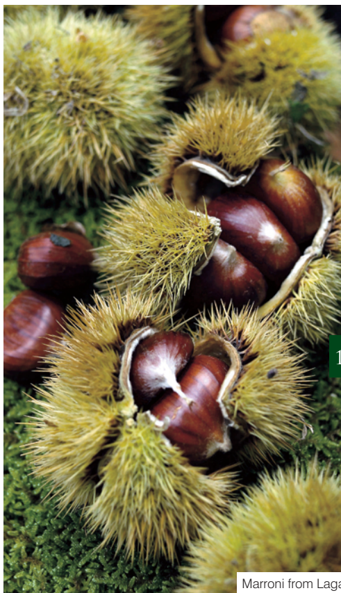
Marroni from Laga

There are many different opportunities for nature lovers. From the Game fishing at the Lago di Talvacchia (Talvacchia Lake) to the skiing in the little ski resort of Monte Piselli . Local dishes and products are delicious. Amongst them there are cheese, porcini mushrooms and " marroni ", a kind of chestnut that stand out for its quality and great taste. Interesting events are the " Notte delle paure " (Night of fears) in July and the " sagra della castagna di Leofara " (Leofara chestnut festival) in November.