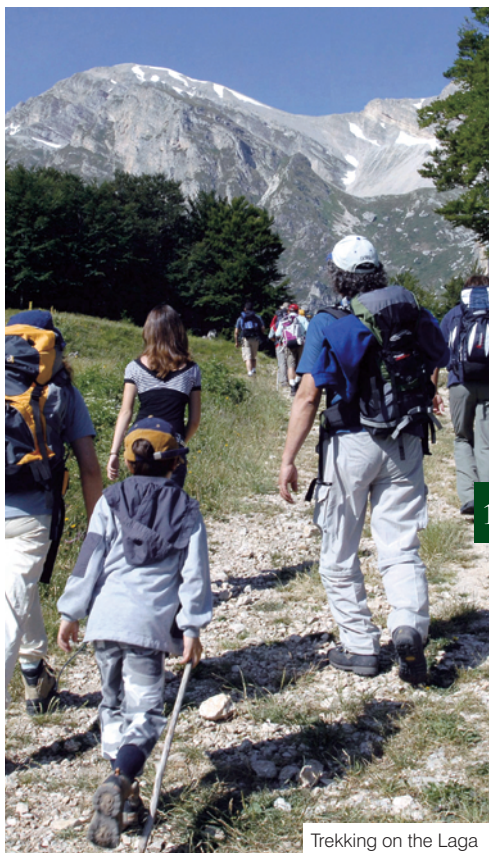
Trekking on the Laga

The villages route is just one amongst the many possible ones. Since nature dominates the scenery there are many possible excursions to go on. There are easy and relaxing itineraries at Ceppo , easy walks for the gathering of porcini mushrooms, local product of prime quality or the gorgeous hike to the Cascata della Morricana (Morricana Waterfall), Pizzo di Moscio and Lago dell'Orso .