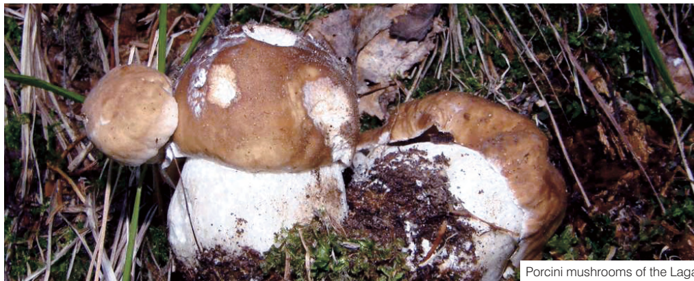
Porcini mushrooms of the Laga

Comune di Cortino Frazione di Pagliaroli Tel. 0861.64112 - Fax 0861.64331 www.comune.cortino.te.it